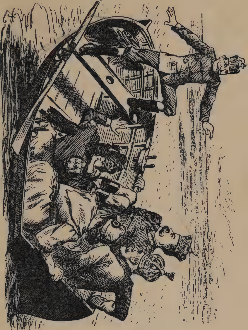
A "PUNCH" CARTOON PUBLISHED A MONTH OR TWO AFTER BISMARCK'S DISMISSAL. THE KAISER IS SHOWN "ROCKING THE BOAT," WHICH HE SUBSEQUENTLY SUCCEEDED IN CAPSIZING